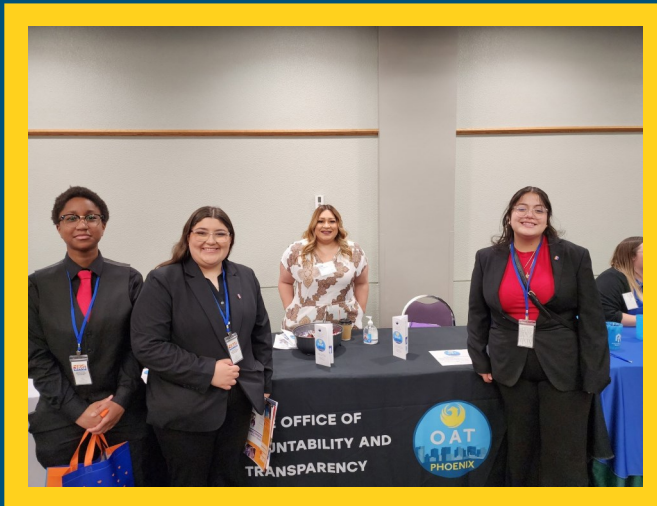
OAT Community Engagement Coordinators at the JAG Career Development Center Expo (above) and the ASU CSRD Delivering Democracy 2023 Community Resource Fair (right).

Additionally, OAT made more than 30 new community engagement contacts this quarter via phone, email, and in-person meetings.